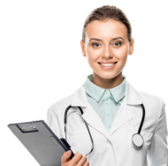
Immediate doctor access by phone to provide diagnosis and treatment guidance