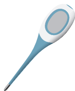
An easy-to-use thermometer