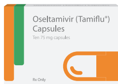
Prescription flu medicine